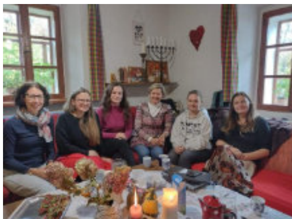
Studentky z VOŠS Caritas Olomouc na praxi, se svými mentorkami a tutorky, které přijely na monitoring ze školy ze střediska praxe.

We are grateful for the long-term cooperation with the Caritas Higher Vocational School of Social Sciences in Olomouc, from where students regularly come to us for practice. They can look under the hood of our facility. To learn from us professional care and professional relationships with clients with mental disabilities. And we and our clients go to their school for a lecture on Archa and the Benediktus community. BeneBend also regularly plays there at the introductory party for the 1st grade, which the school organizes every September. These interns sometimes become a volunteer or even an employee. That is why these practices are even rarer in our country.